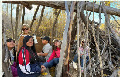
IDAHO BASE CAMP