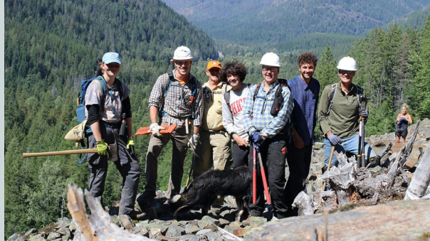
IDAHO TRAILS ASSOCIATION