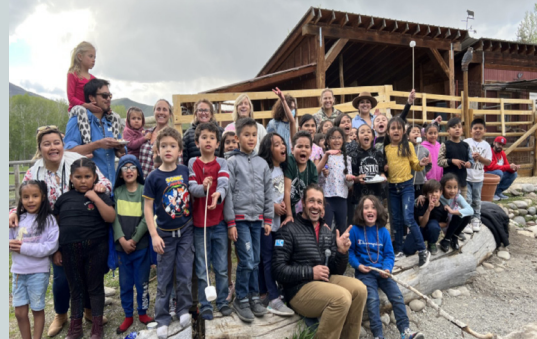
I HAVE A DREAM FOUNDATION

Swiftsure Therapeutic Ranch — Safety Surround Wall $14,200