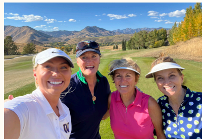
"NINE & WINE" EVENT PARTICIPANTS