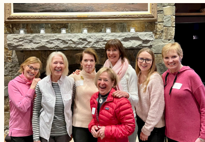
GRANTS PINK TEAM