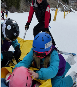
KIDS MOUNTAIN FUND