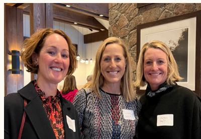
GRANTS LEADERS 2022

TAX-EXEMPT 501(C) (3), FEDERAL TAX ID #81-4000190