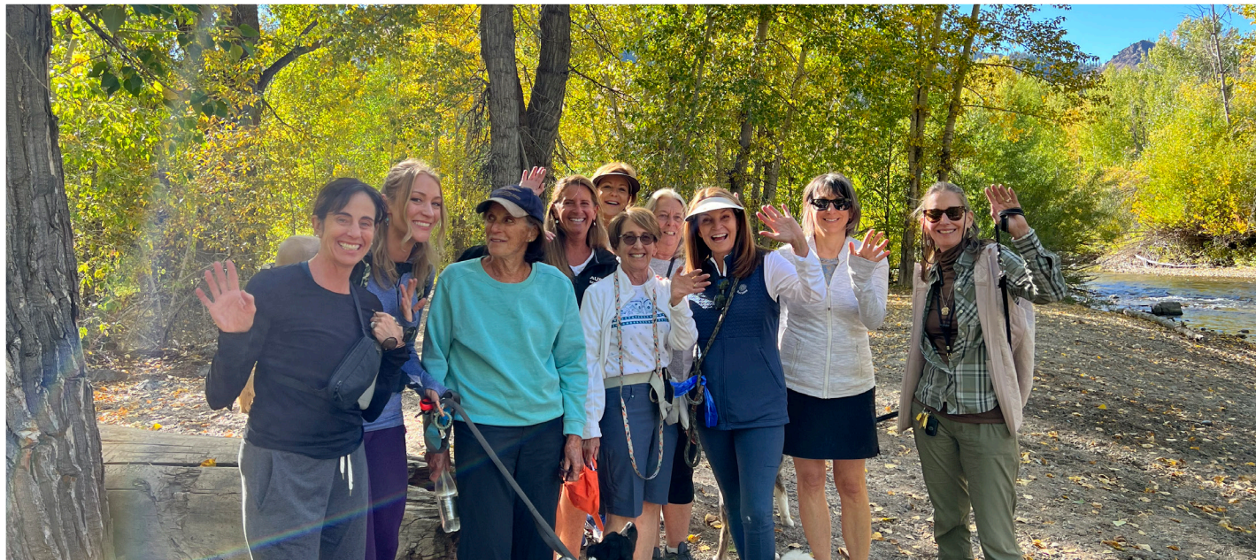
SEPTEMBER '22 BOARDWALK OUTING WITH WRWF MEMBERS