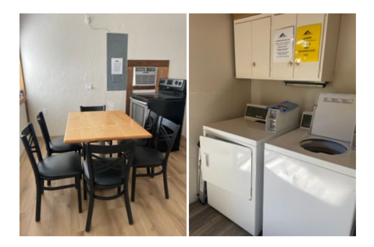
New Kitchen and Laundry Room for the 14 rooms at the Lift Tower Lodge